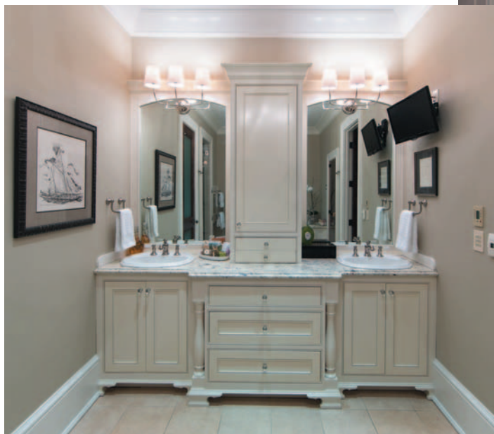
RIGHT: Use of light marble in the master bathroom complements the home's neutral color palette.