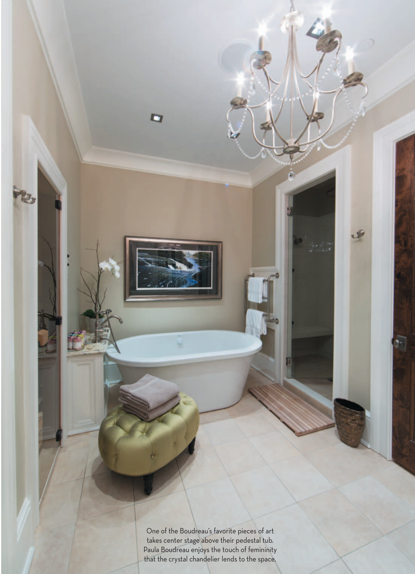
One of the Boudreau's favorite pieces of art takes center stage above their pedestal tub. Paula Boudreau enjoys the touch of femininity that the crystal chandelier lends to the space.