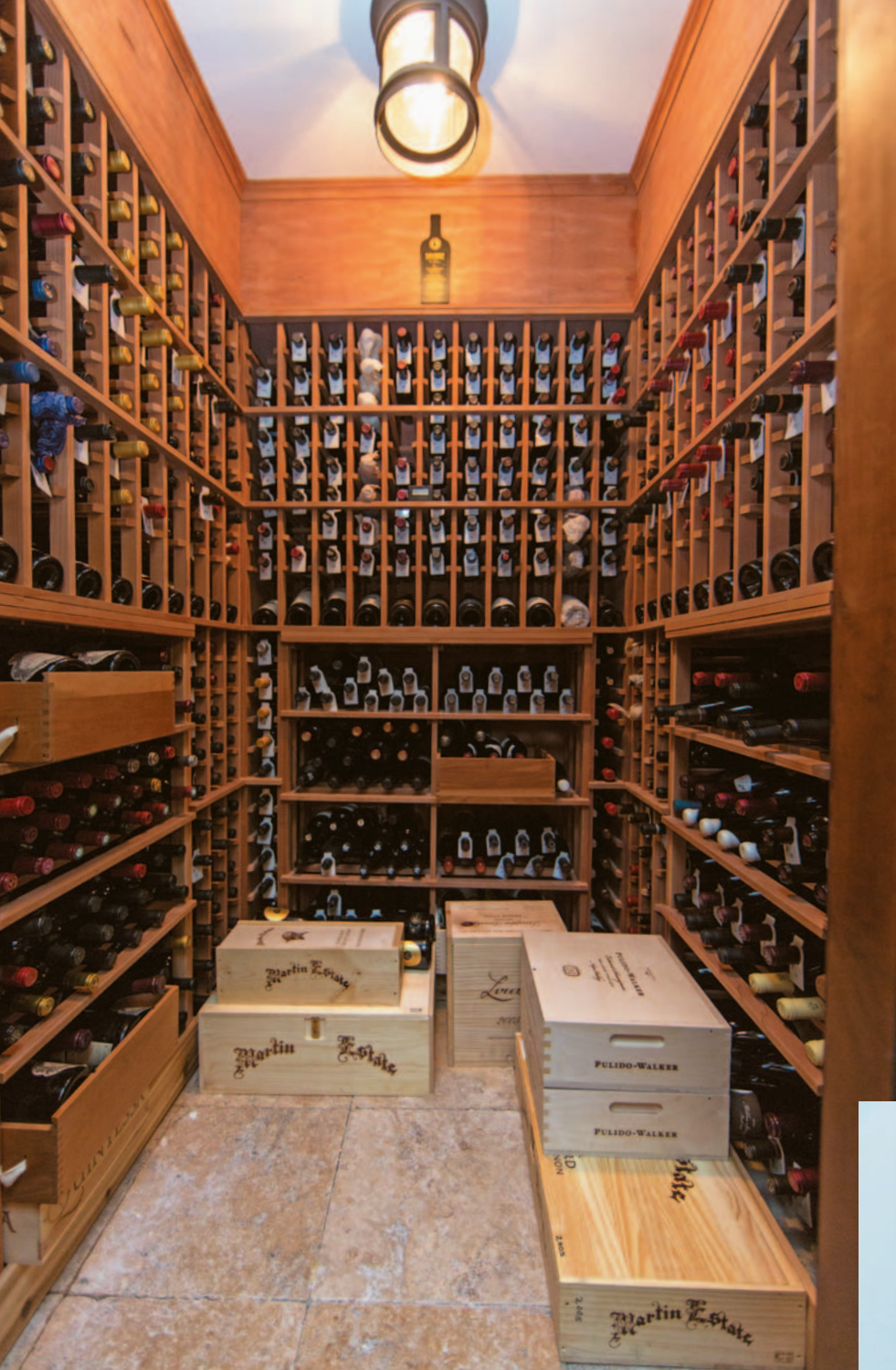
ABOVE: Each condo in the building is outfitted with a downstairs wine cellar. Joe Boudreau enjoys collecting wine from the couple's time in California.