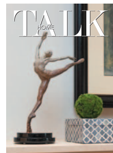
See more home photos at www.talkgreenville.com .