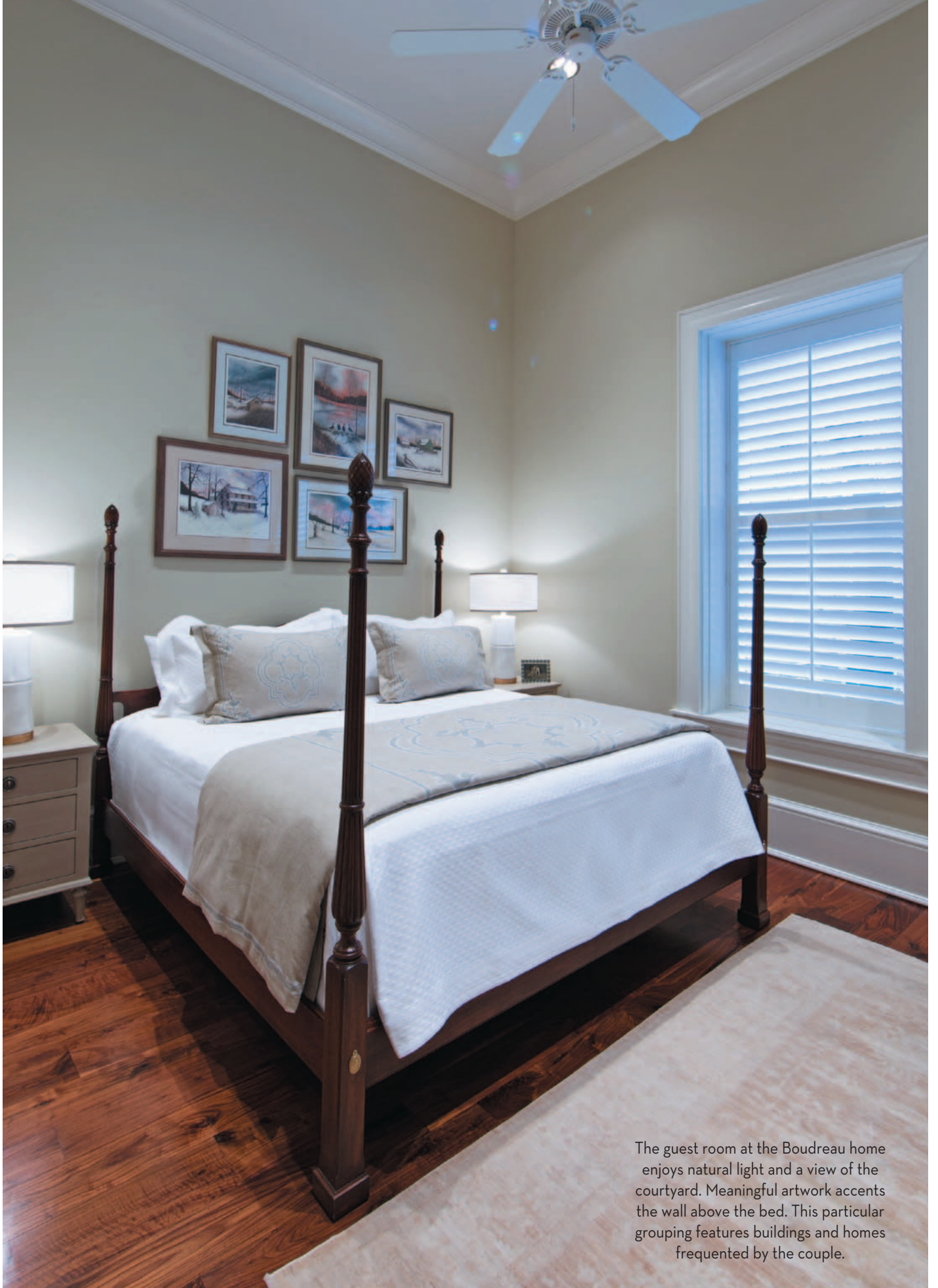
The guest room at the Boudreau home enjoys natural light and a view of the courtyard. Meaningful artwork accents the wall above the bed. This particular grouping features buildings and homes frequented by the couple.