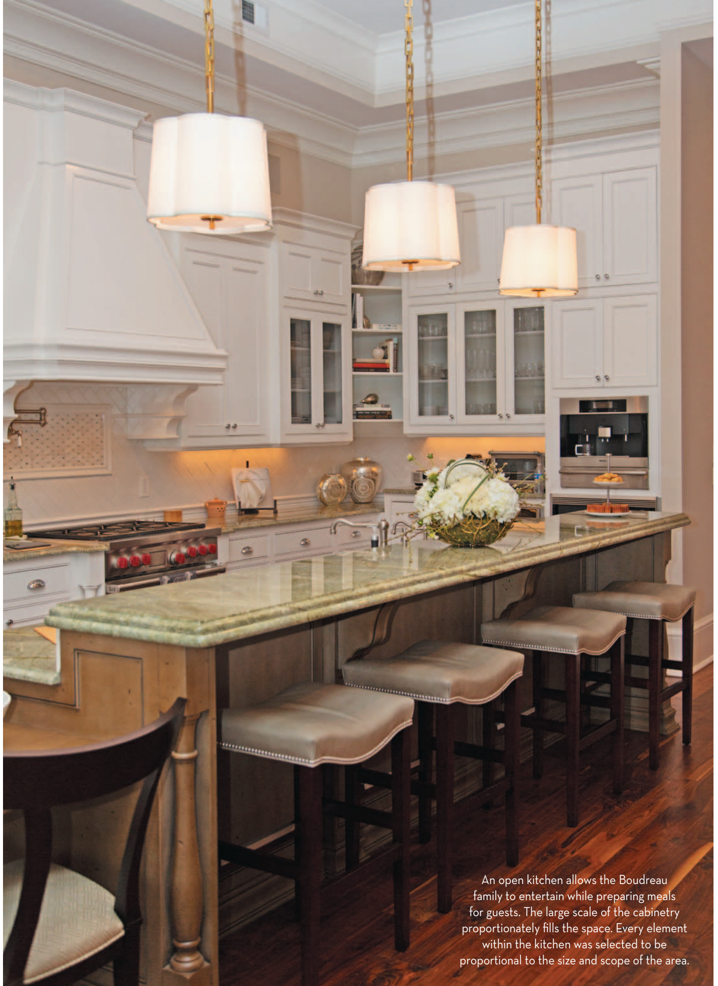
An open kitchen allows the Boudreau family to entertain while preparing meals for guests. The large scale of the cabinetry proportionately fills the space. Every element within the kitchen was selected to be proportional to the size and scope of the area.