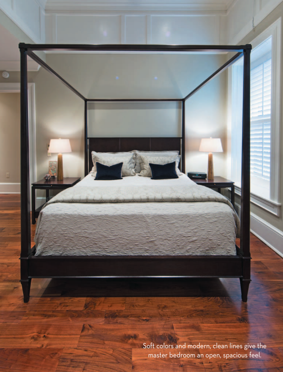
Soft colors and modern, clean lines give the master bedroom an open, spacious feel.