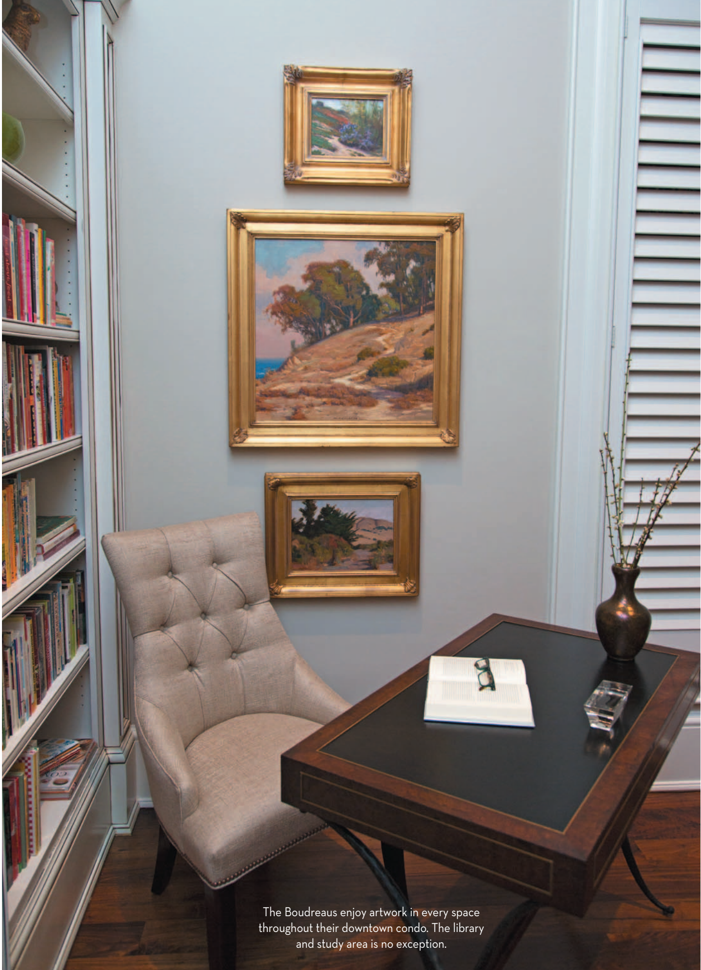
The Boudreaus enjoy artwork in every space throughout their downtown condo. The library and study area is no exception.